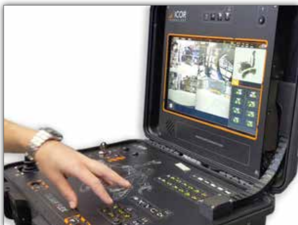
Touch screen Presets