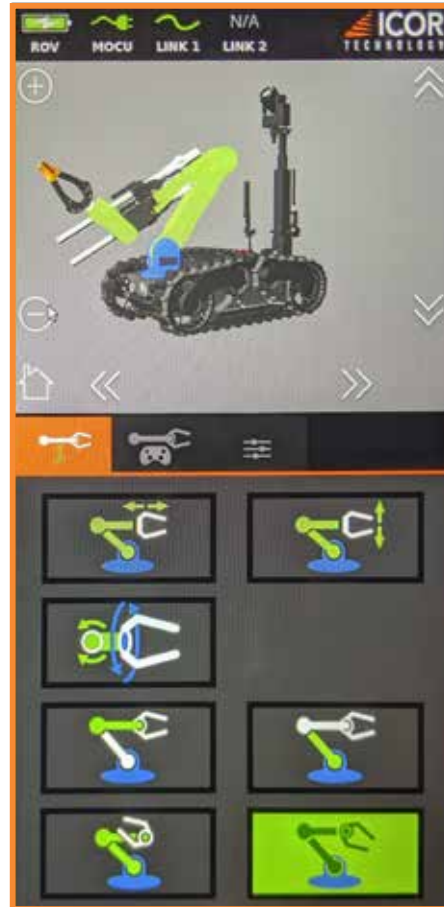
Real-time 3D Avatar