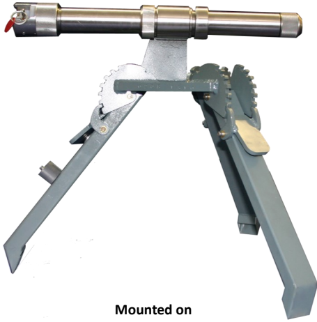
Mounted on 20mm Neutrex Stand