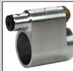
20mm Single Laser