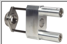
RAM Recoil Absorbing Mechanism