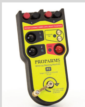
P2 Blasting Machine