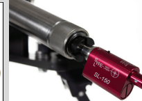
Bore Laser Kit