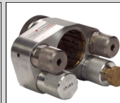
20mm Dual Laser