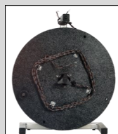
Wire Wheel 100 m (330 ft)